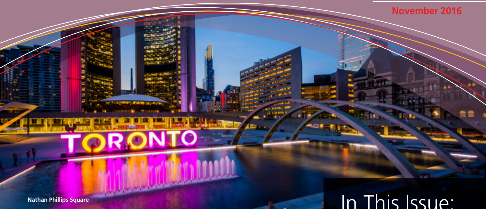
Nathan Phillips Square